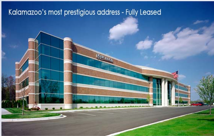
Kalamazoo's most prestigious address - Fully Leased