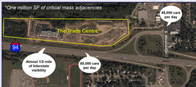
High Traffic, Unparalleled Visibility, Convenient Local and Regional Access