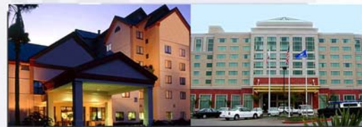
Upscale, residential style hotel