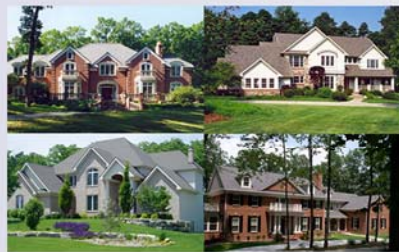
Surrounded by Upscale Residential