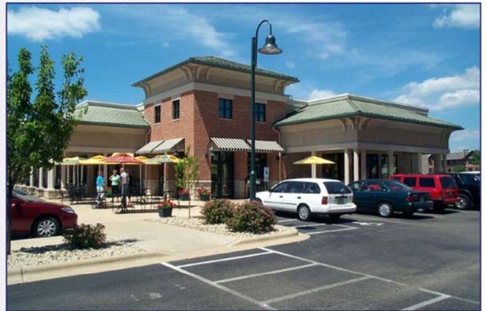
Conceptual Illustration of Proposed Upscale Retail/Fast Casual

Portage, MI - Welcome to the land of rolling hills, sparkling clear lakes, stellar recreation, and stunning entertainment. With a diverse and rich culture, Southwest Michigan is the ideal destination offering attractions, lodging, recreation, housing, dining, and shopping for every preference and budget. With more than 2,600 hotel rooms, this scenic year-round community offers a newly renovated, vibrant Art Deco downtown, historic neighborhoods, outstanding museums and theatres, 3 ski resorts, 4 wineries, 22 golf courses, and 83 lakes with public access.