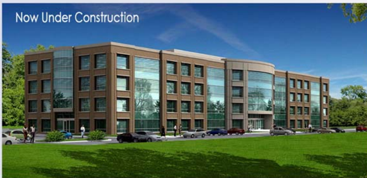
Now Under Construction